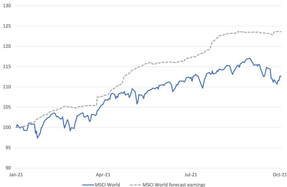
Chart 3: Expected level of corporate profits rises much more sharply than the index rebased to 7th January =100

The pause in the equity markets' advance has led to a more substantial gap between the rise in the level of consensus corporate profit expectations for 2021 and the level of the global equity index (Chart 3). The expected level of corporate profits has risen nearly 24% year-to-date, yet the global equity index is up just 12%.