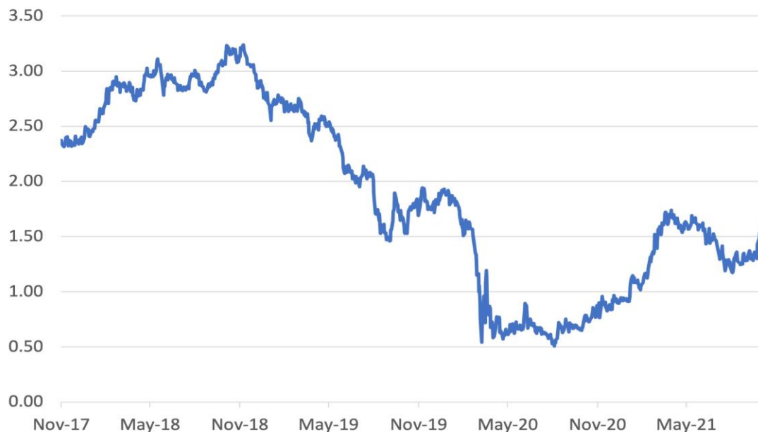
Chart 4: US 10-year government bond yield (%)

that the spike has occurred at a time of weakening global growth. Given that backdrop, consider where the yield might be if we have a recovery in consumer spending, ongoing higher-than-expected energy prices and a global re-stocking cycle, all meeting still dysfunctional supply lines. Even though last week's headline US employment growth disappointed the market, the stronger-than-expected working hours and wage growth figures kept the bond market from rallying.